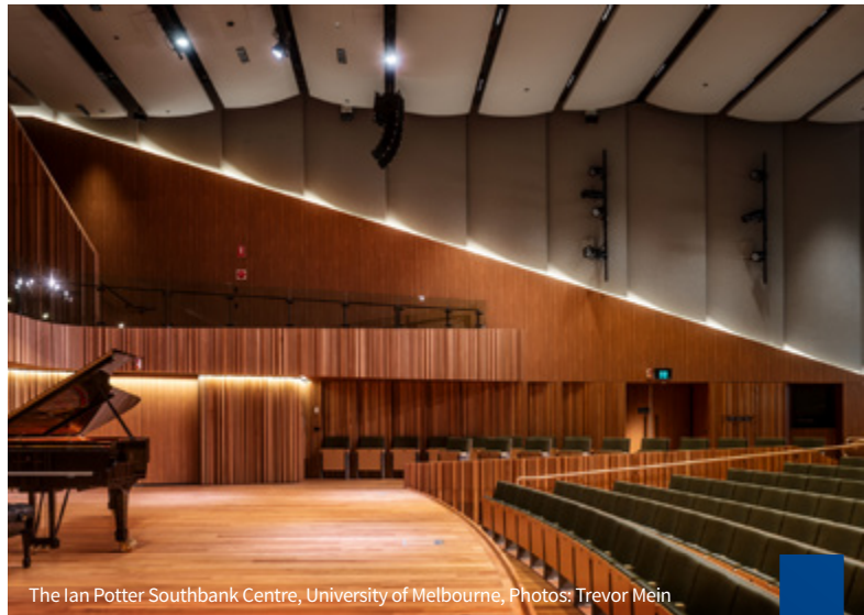
The Ian Potter Southbank Centre, University of Melbourne